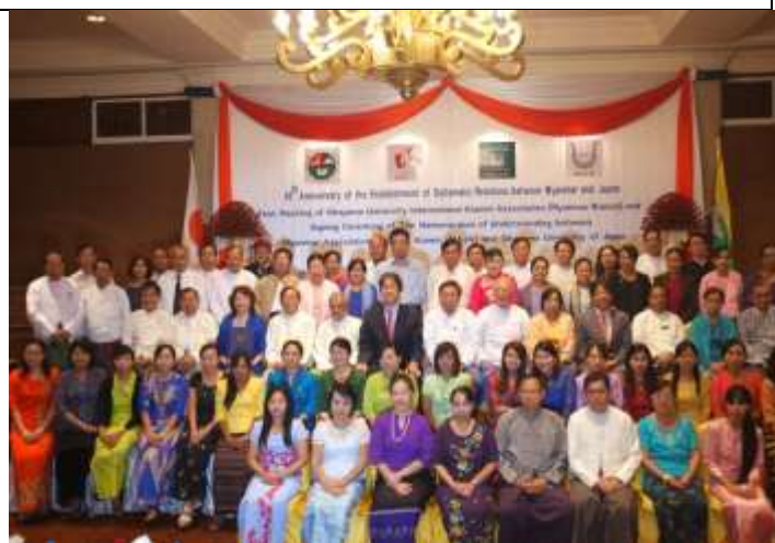
A group photo with Alumni members