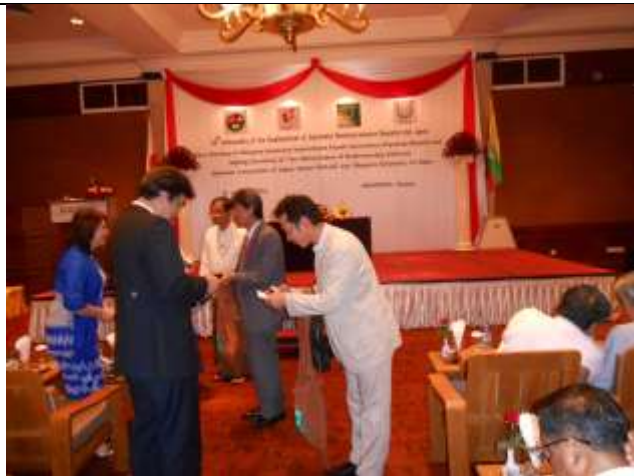
Arrival of the guests