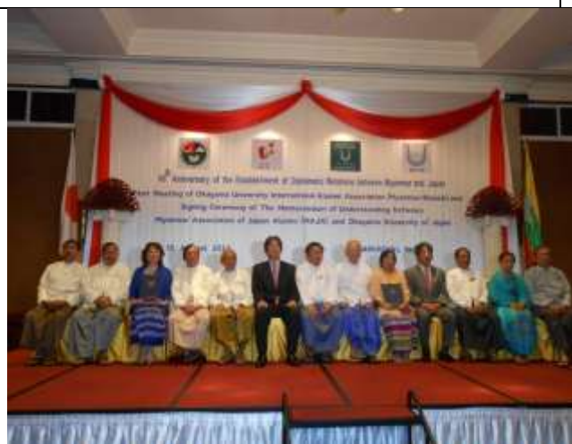
Distinguished guests attending the Inauguration Ceremony