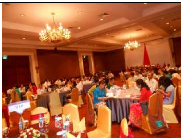
Alumni members listening to the Congratulatory Remarks