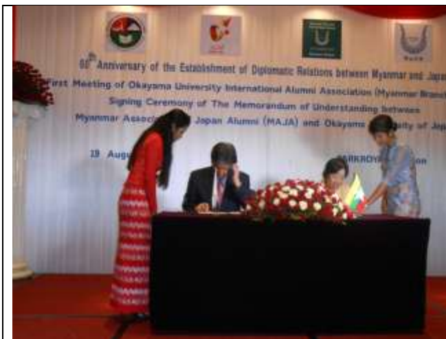
Presidents signing the MOU between MAJA and Okayama University