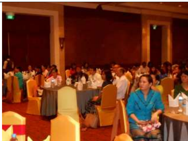
Alumni members listening to the speech