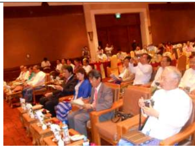
Distinguished Guests attending the ceremony