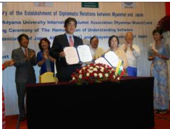
Distinguished Guests celebrating the MOU signing