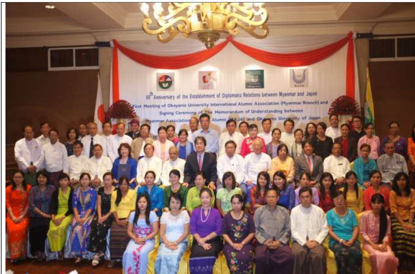
Group photo of Distinguished Guests with Alumni members celebrating the first meeting of Okayama University International Alumni Association Meeting and the MOU signing ceremony between MAJA and Okayama University(19 th August 2014, Park Royal Hotel, Yangon, Myanmar)