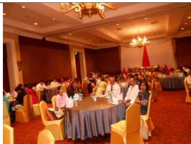
Alumni members listening to the Congratulatory Remarks