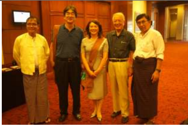
Preliminary meeting on the 18 th August 2014, Park Royal Hotel, Yangon