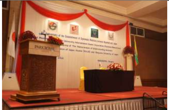
Venue Prepared at evening of 18 th August 2014, Park Royal Hotel, Yangon