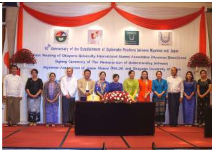
OUIAA Myanmar Branch Organizing Committee Members