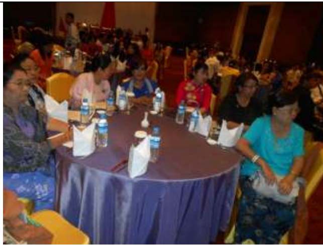
Alumni members listening to the speech