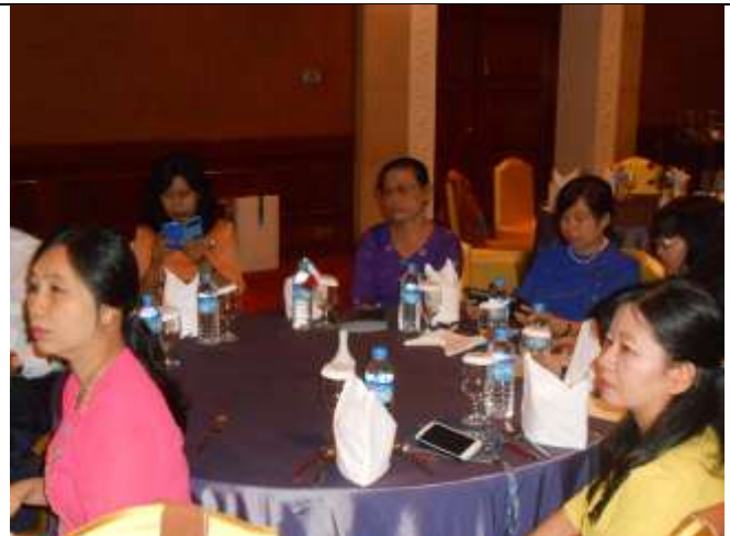
Alumni members listening to the speech